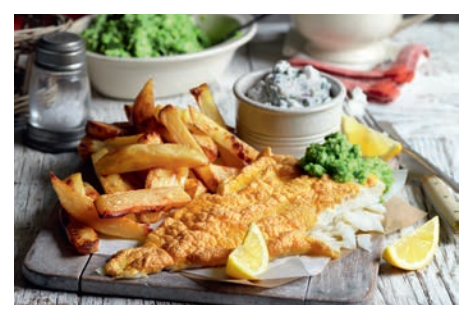
Fish and chips Serves 4 2 Syns per serving Ready in 45 minutes

Mix together the lime juice, yogurt and 3 tablespoons of the tikka curry powder. Season, then add the chicken and toss to coat. Marinate in the fridge for 4 hours. When you're ready to cook, preheat the grill to medium. Spray a large non-stick frying pan with low calorie cooking spray and place over a medium heat. Add the onion, garlic, ginger, chilli, cinnamon, cumin and remaining tikka curry powder and fry for 2-3 minutes. Stir in the tomato purée and 250ml of water. Bring to the boil, then simmer for 12-15 minutes, stirring often. Meanwhile, grill the chicken pieces for 12-15 minutes or until cooked through, turning occasionally. Remove the chicken and stir into the sauce. Take the sauce off the heat, stir in the fromage frais and scatter over the coriander.